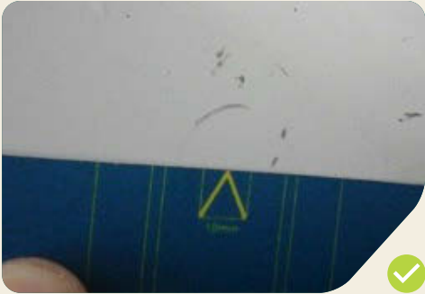
Scratches that reflect normal use are acceptable.